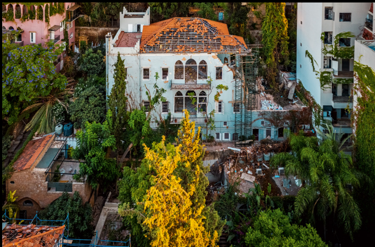
FROM TOP: Saint Antoine de Padoue, Gemmayzeh, 17th August 2020; Gemmayzeh old buildings, 17th August 2020. OPPOSITE PAGE: The Port of Beirut, 11th August 2020.