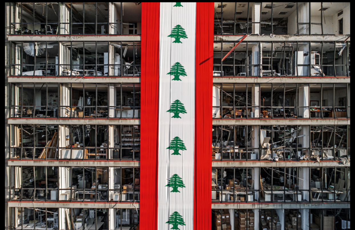
FROM TOP: Mar Mikhael street, 17th August 2020; Pasteur street, Gemmayzeh, 17th August 2020.